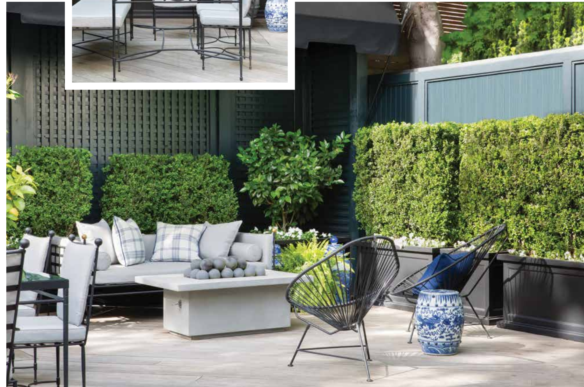
(PREVIOUS PAGES) PHOTO CREDIT: JASON LISKE | (THIS PAGE) PHOTO CREDIT: SUZANNA SCOTT | (FOLLOWING PAGES) PHOTO CREDIT: AARON LEITZ

“AN ALFRESCO DINING AREA IS FRAMED BY POTTED FRUIT TREES AND A CRENELLATED BLACK AWNING, CREATING A FEEL HAINES DESCRIBES AS “MODERN AND CLEAN.”